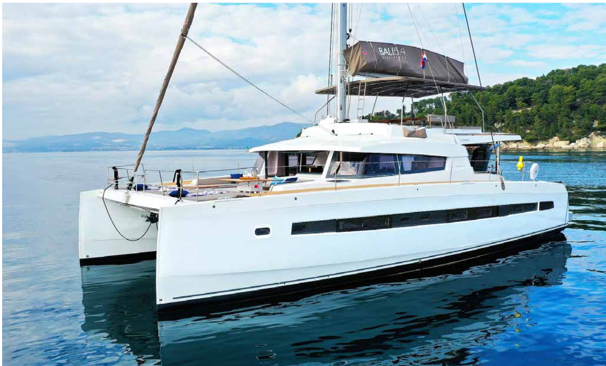
●●● Sailing Catamaran Bali 5.4 - EQ Horizon